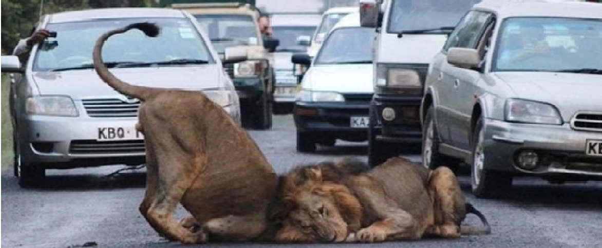
Traffic tie up – Escaped lions from Nairobi National Park add to Kenyan commuters' woes.