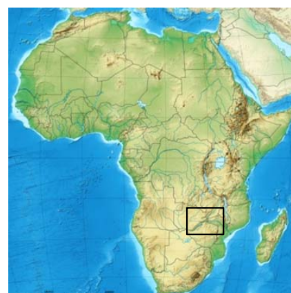
Crossing the Zambezi – Our route from Harare to Lusaka through Zimbabwe and Zambia.