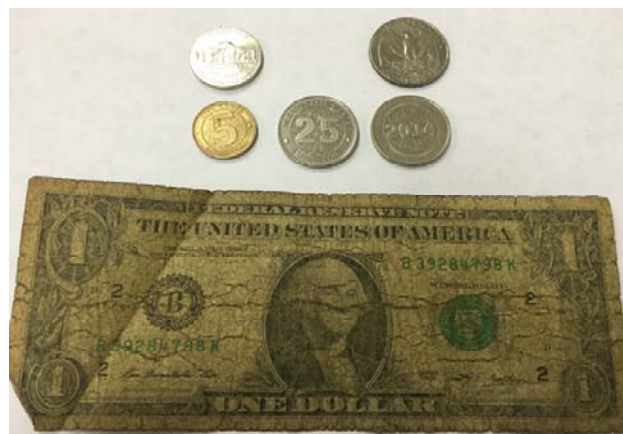
Bond coins (center row) enable Zimbabweans a way to make change from US paper currency.