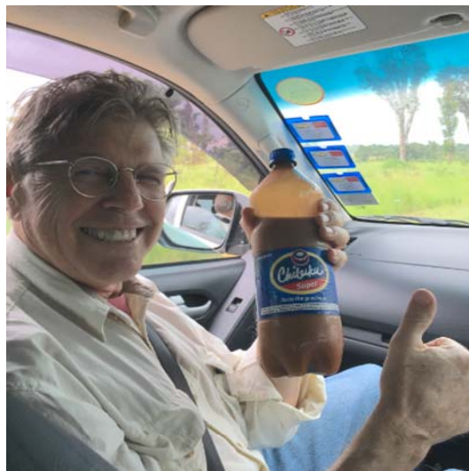
Chibuku – a sorghum beer designed for the price point of African consumers and packaged for a sharing culture offers good value and the promise of camaraderie. (Editor’s note: The author is clearly enjoying this beverage from the passenger’s seat.)

Chibuku Super is not a bad drink at all, with its slightly earthy taste and somewhat mealy texture... no doubt laden with nutrients. It might not be my first choice, but in a pinch, give me a Chibuku any day!