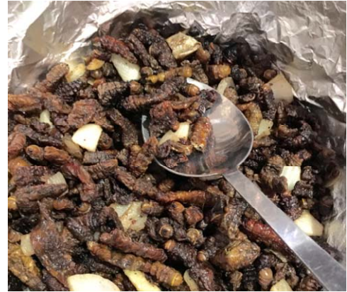
Matter of Taste – Worms at the Southern Sun Hotel in Lusaka seeks to accommodate many palates.