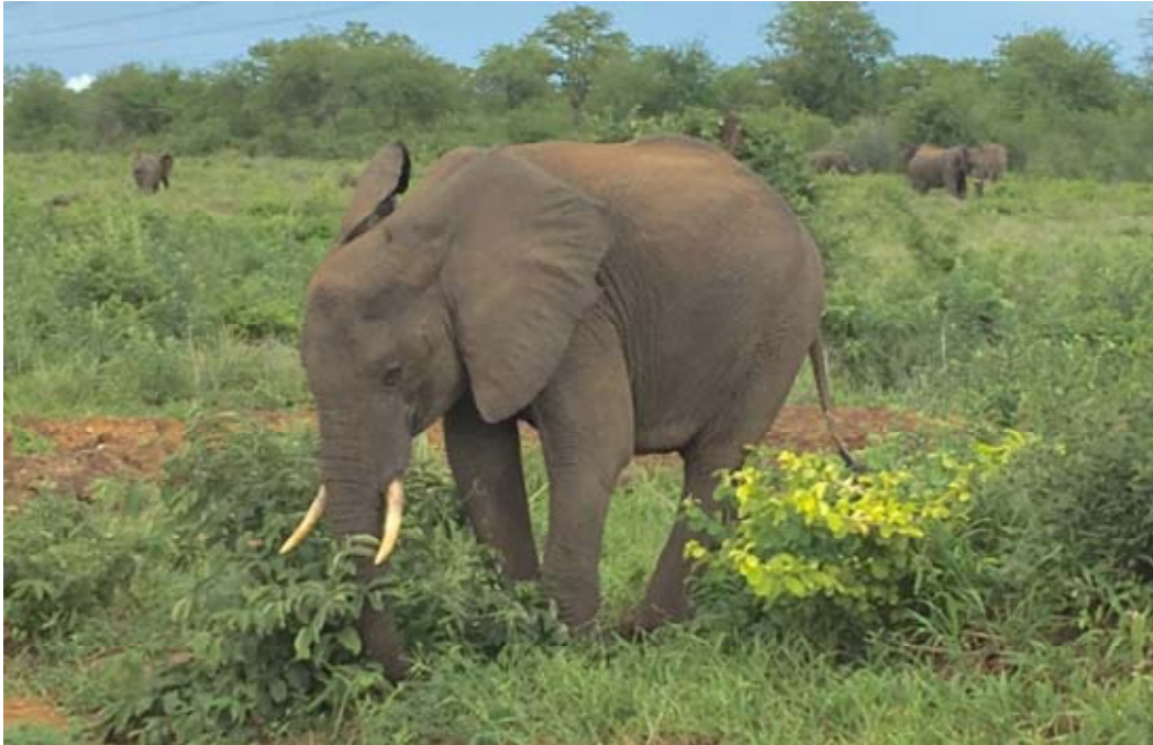
Powerline Road, Kariba, Zimbabwe