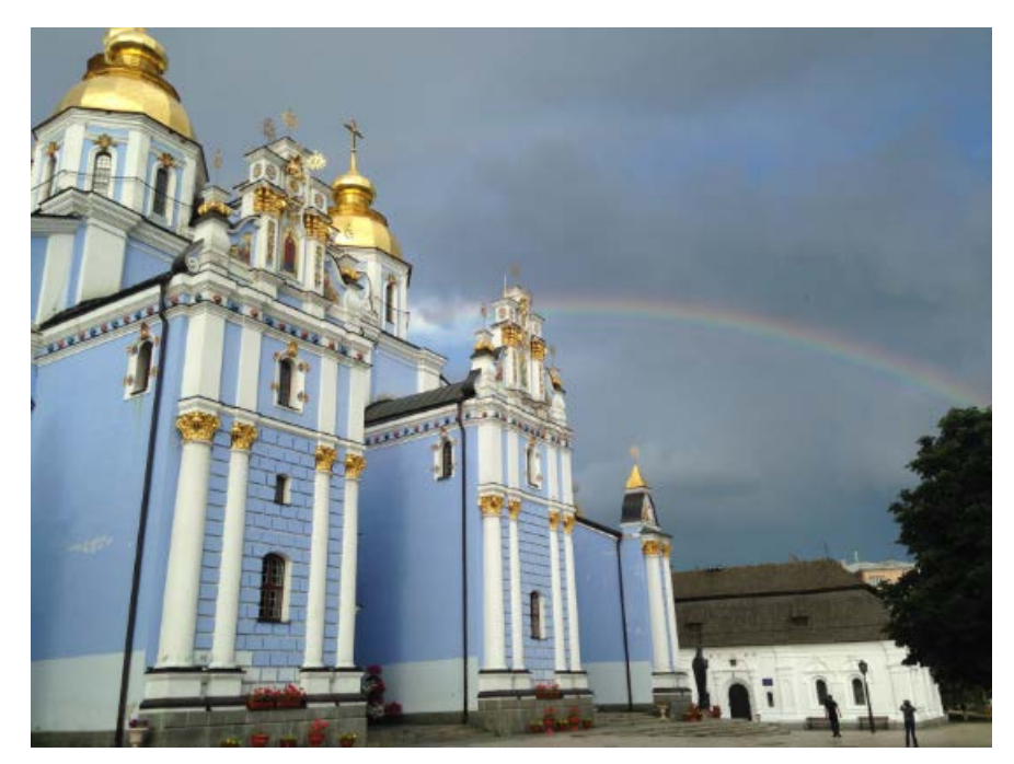
Mikhailovsky Monestary, Kiev