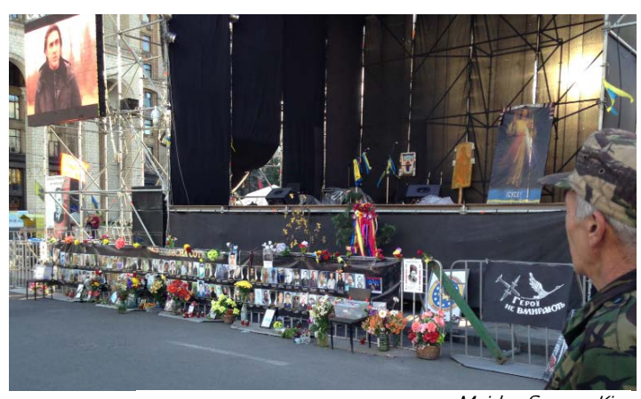
Maidan Square, Kiev

Speeches and songs ring out from a bandstand with a large-screen TV and a row of memorials to the hundred who died here in February.