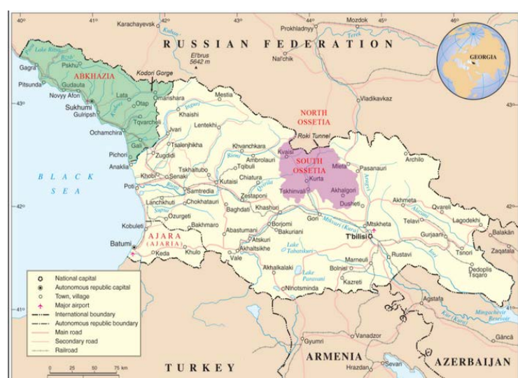
The disputed territories of Abkhazia and South Ossetia are de facto independent from Georgia

At dawn, our Air Baltic flight 725 rises northwest from Tbilisi, above green hills punctuated with limestone escarpments. It climbs above the pronged white peaks of the Caucasus Mountains, into Russia east of Sochi. Then the flight passes on a line into Ukraine, east of Crimea and the Sea of Azov and above Donetsk, with its pro-