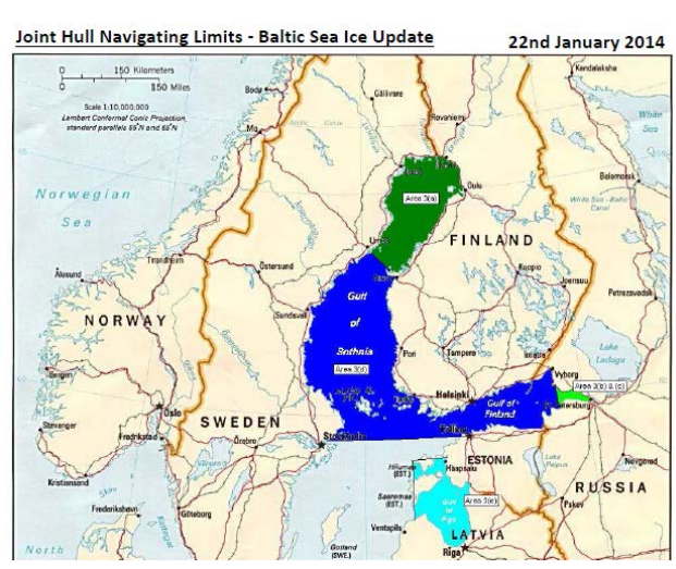
Ice in the Baltic Sea, January 22, 2014

Despite Riga's scattered crumbling Soviet-era apartment blocks, the Baltic countries feel mostly Scandinavian. A restaurant in Vanalinn (Tallinn's Old Town) says diplomatically that: