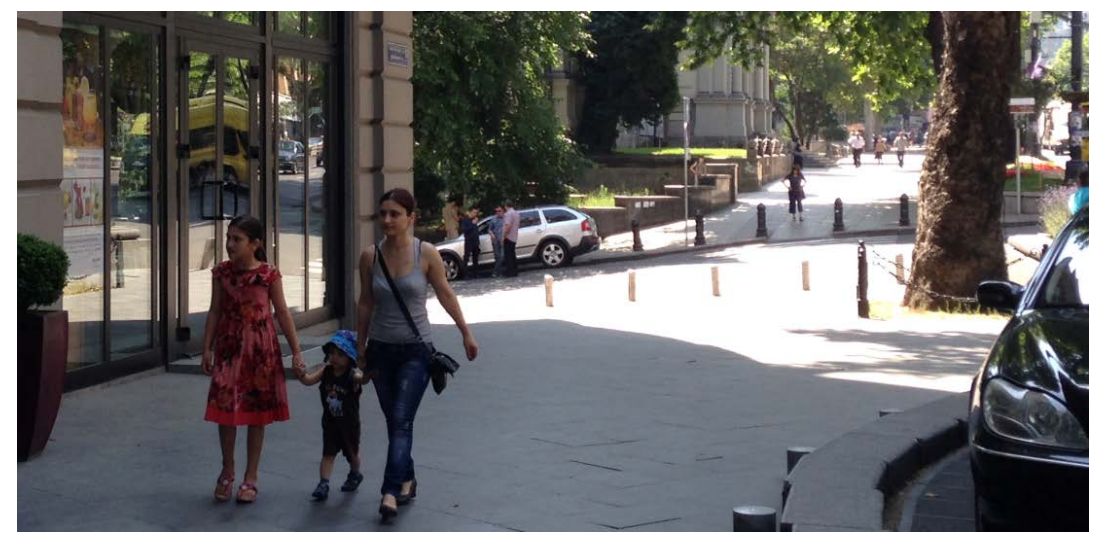
Rustaveli Avenue, Tbilisi, Georgia

What Georgia has moved on to a miracle of reform. The country has shrugged off the corruption of Soviet times and achieved one of the cleanest economies in the world. Corruption was punished with jail terms for hundreds of officials. The formerly bloated government has shrunk so much that it freed up 50,000 square meters of office space, including making room for a new Marriott Hotel in the former Ministry of Agriculture building.