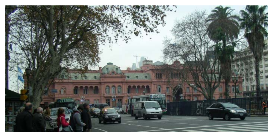
Plaza de Mayo, Buenos Aires

Back in 1993, I had joined a group of investors to visit Economic Minister Domingo Cavallo at a table seating forty in the imposing granite ministry building facing Plaza de Mayo. Those were heady times: President Menem and Cavallo, advised by Art Laffer and economists from the University of Chicago, had pegged the peso at one to the U.S. Dollar, promising an end to Argentina's recurrent inflation crises. Their policies worked... for a while.