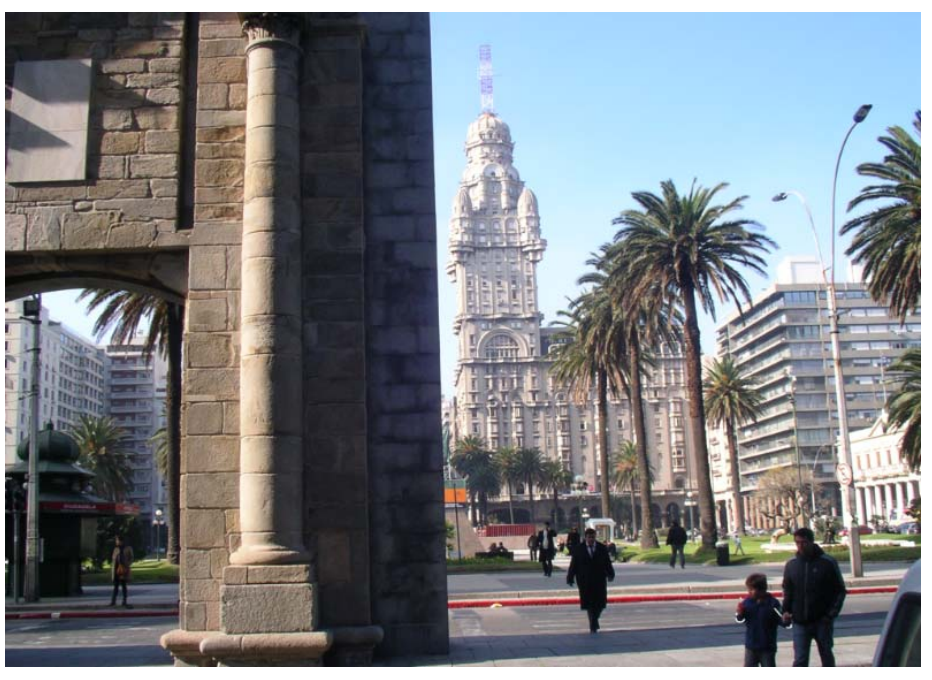
Puerta de la Cuidadela, 1833, and the Palacio Salvo, 1927, Montevideo, Uruguay

For $25,000 you can get your Jeep Cherokee bullet-proofed... with Kevlar in the doors and 3/4" glass. It is a good thing my friend in Sao Paulo did that. His wife was at an intersection when a thief tried to climb in, found the doors locked and fired two shots at her through the glass. He ran off. The bulletproofing saved her life.